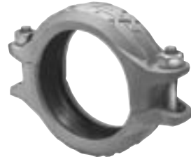
Style 07 Zero-Flex Rigid Coupling