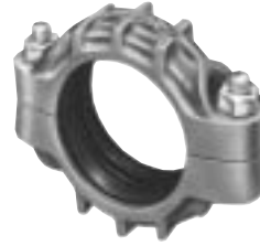
Style 77 Flexible Coupling