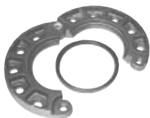
Style 743 Vic-Flange® Adapter