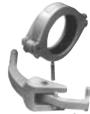
Style 791 Vic-Boltless® Coupling