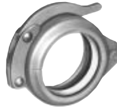
Style 78 Snap-Joint® Coupling