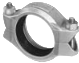
Style 75 Flexible Coupling