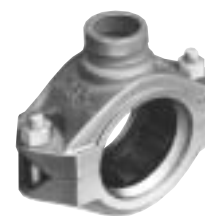
Style 72 Female Threaded Outlet Coupling Style 72 Grooved Outlet Coupling