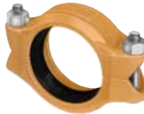
Style 75 Standard Coupling