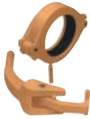
Style 791 Vic-Boltless® Coupling