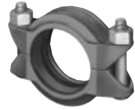
Style HP-70 Rigid Coupling