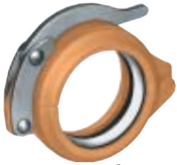
Style 78 Snap-Joint® Coupling