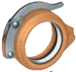
Style 78 Snap-Joint® Coupling