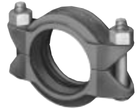
Style HP-70 Rigid Coupling