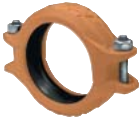
Style 07 Zero-Flex® Coupling