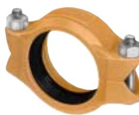
Style 75 Standard Coupling