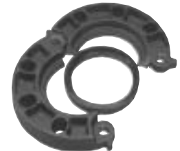
Style 741 Vic-Flange® Adapter