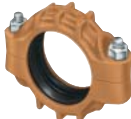
Style 77 Flexible Coupling