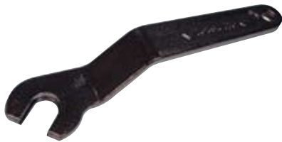
MODEL V27 OPEN END