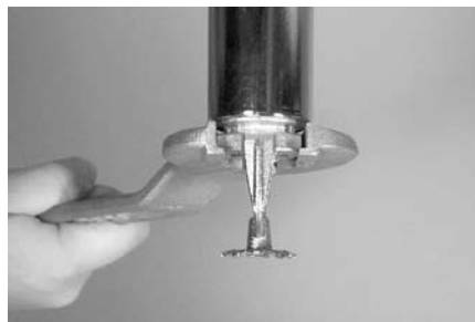
CORRECT ENGAGEMENT FOR MODEL V36 OPEN-END WRENCH