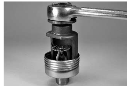
CORRECT ENGAGEMENT FOR MODEL V39 WRENCH ON V27 CONCEALED SPRINKLER