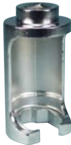
MODEL V34 RECESSED