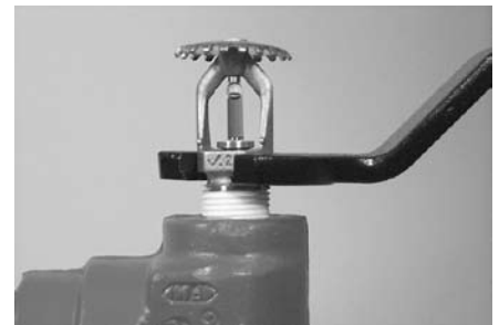
CORRECT ENGAGEMENT FOR MODEL V27 AND MODEL V34 OPEN-END WRENCH