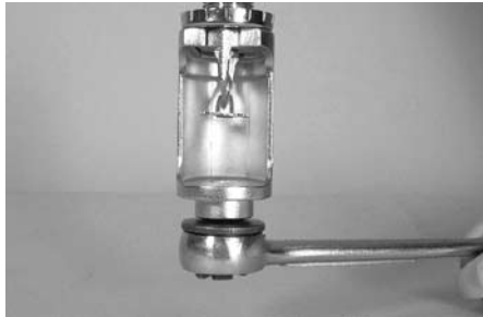
CORRECT ENGAGEMENT FOR MODEL V34 RECESSED WRENCH

Failure to follow these instructions could cause damage to sprinkler components, resulting in improper spray pattern, leakage, non-operation, and property damage.