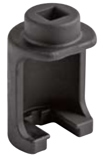
MODEL V39 CONCEALED