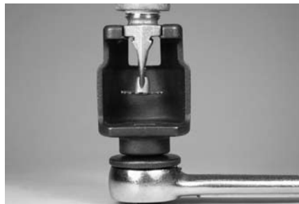
CORRECT ENGAGEMENT FOR MODEL V27-1 RECESSED WRENCH

Failure to follow these instructions could cause damage to sprinkler components, resulting in improper spray pattern, leakage, non-operation, and property damage.