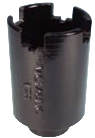
MODEL V29 CONCEALED