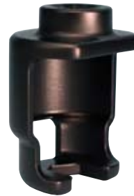
MODEL V27-1 RECESSED

In addition to standard offset open end wrenches, there is a socket for some sizes and open sided specialized wrenches for recessed or concealed installation.