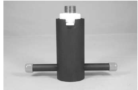
CORRECT ENGAGEMENT FOR MODEL V29 SOCKET WRENCH