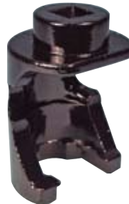
MODEL V36 RECESSED/CONCEALED (USED WITH MODELS V36 OR V39 SPRINKLERS)