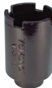
MODEL V38-4 SOCKET CONCEALED