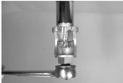
CORRECT ENGAGEMENT FOR MODEL V36 RECESSED WRENCH