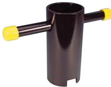
MODEL V38-5 OR MODEL V29-1 TEE HANDLE SOCKET