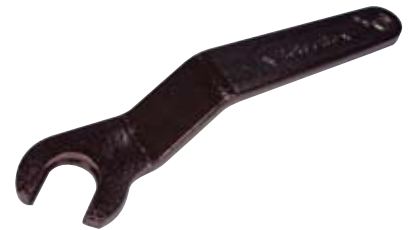
MODELS V34 & V36 OPEN END (USED WITH MODELS V34 OR V36 SPRINKLERS)