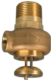
Series 953 Emitter